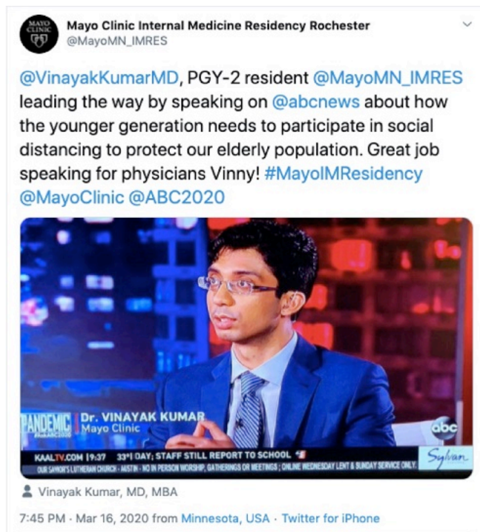
Figure 5: An internal medicine residency program highlighting unique advocacy and public education endeavors by a trainee. Available at: https://twitter.com/MayoMN_IMRES/status/1239744577030049794?s=20

volunteerism. Posting of legislative or public policy involvement activities highlight the importance of advocacy in your program. Look for opportunities to share these moments that make you program to lead your program and share those. Thus express the culture of the program while simultaneously amplifying your trainee's accomplishments.